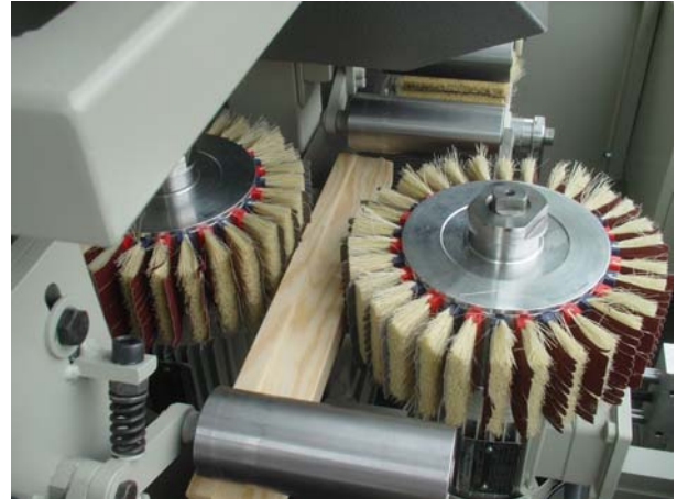
The inside of an LZ 3 with belt feed, hold down rollers and tilted heads shown left. Side heads shown right.